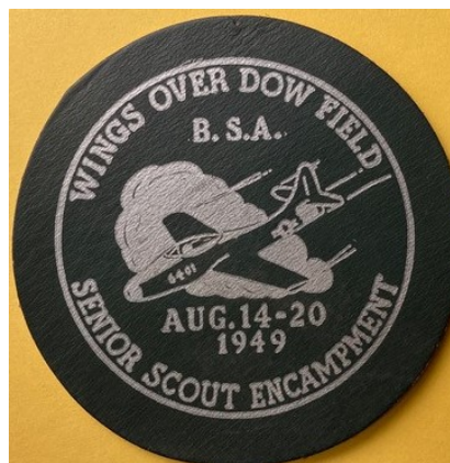
Senior Scout Encampment Badge