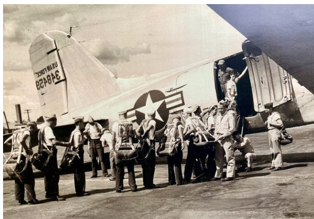
The Scouts being fitted with parachutes for their Orientation Flight on the C-47