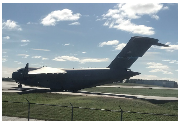
C-17 taxiing for take-off on October 28, 2021

From the Viewing Platform at the Maine Air Museum -